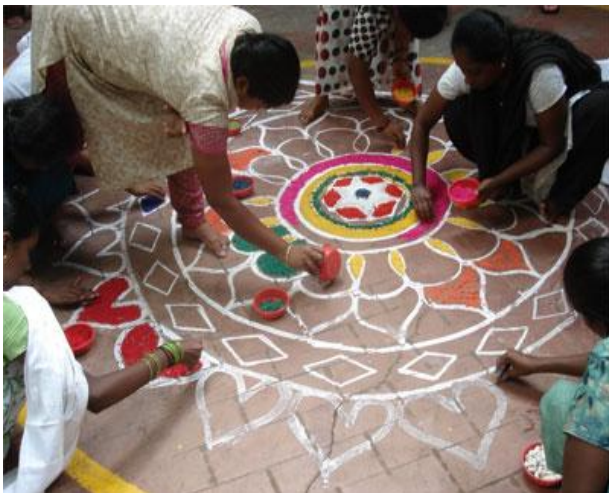
Indian women creating a traditional rangoli design at the Bambino School in Chennai, India. Rangoli loosely means "row of colors".