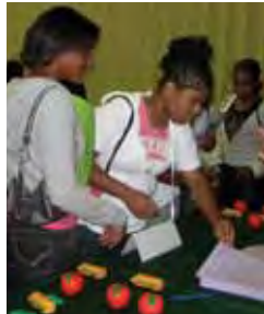
Participants picking up Go-GIRLS program information.

GO-GIRLS hosted another exciting event this year, and has another one on tap for 2010. Both are part of a new initiative: Operation KiT (Keeping in Touch), which