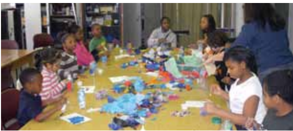
Pictures: Participants in the Saturday Art Therapy Winter Workshop