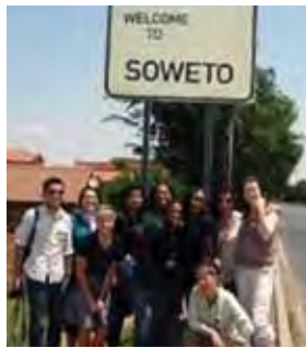
Group arriving in Soweto

The group used current web technologies, such as web hubs, blogs and other social networking tools, to share their experiences, not only with the Wayne State University community but the global community as well. Using these social networking tools helped to dispel common myths associated with Africa. At the conclusion of the project a documentary was produced that includes an interview with the former President of Mozambique, Joaquim Chissano, who continues to work diligently to support democracy and development in this region of the world. The documentary will be shown during Mr. Chissano's visit to Wayne State University in 2010.