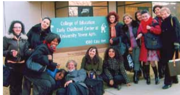
Group visits the college's Early Childhood Education Center on campus.

mutual understanding and respect between individuals from different countries and cultures. In addition to participating in a seminar in the College of Education with COE faculty, the group visited the COE Early Childhood Center, WSU Barnes and Noble