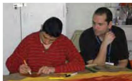
Art therapy student working with Lincoln Park High School student participating in Avenues at Wayne project.

The Blue Door Campaign is an aggressive student retention effort to show students, parents and all of metro Detroit the exciting learning opportunities available in DPS schools. DPS officials created the campaign to stabilize student enrollment and thus help safeguard resources and staff necessary to provide quality education for all the district's students. ■