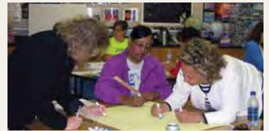
Students working together on a group project in the classroom.