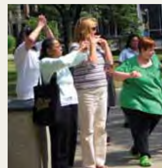
Students participating in a Project Wild outside activity.