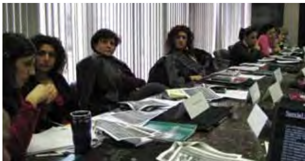
Armenian educators meet with COE faculty to discuss special education training programs.

As part of a visit to special education programs in the Detroit area, ten Armenian special educators visited the Wayne State University campus to learn about the college's special education training program that places emphasis on field-based initiatives. In turn, the COE faculty was informed about the special education system in Armenia. The trip was sponsored by IVC, connecting regional Detroit with global leaders. The purpose of the organization is to break down barriers and misconceptions, and to promote