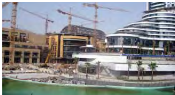
Completion of Dubai Mall, largest mall in the world.

The team also created a model for "Rapid Prototyping