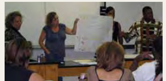
Displaying results of group project.

institute that included professional development activities related to inquiry-based teaching, technology, assessment, classroom management and grant writing. The teachers also received training in Project Wild and Wild Aquatic as well as training in the Michigan Environmental