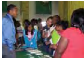
Go-GIRLS participants having their questions answered.