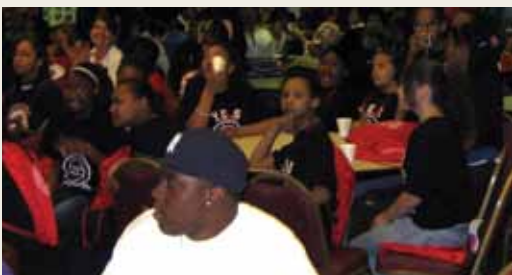
Participants at Y.E.S. conference

In May 2009, the College of Education hosted the annual Young Educators Society (Y.E.S.) conference for over 400 middle and high school students and guests. One of the main goals of Y.E.S. is to encourage middle school, high school and college students to pursue careers in education. Wayne State University is one of ten participating colleges and universities in the Michigan Chapter of Y.E.S. Y.E.S. also partners with fifteen school districts from all over the state of Michigan. Saginaw Valley State University will host the 2010 Annual Spring Y.E.S. Conference. ■