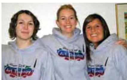
Art therapy students wearing sweatshirts that are being sold to raise funds in support of program activities.