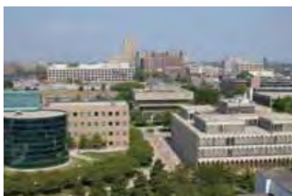
View of portion of WSU's main campus, Education building at the right.

Purpose: To provide an instructional technology graduate-level course (IT 7240) for selected Detroit Public School employees to enhance their technology application skills in education. ■